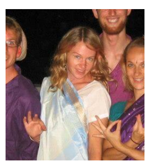
Abi India 2013