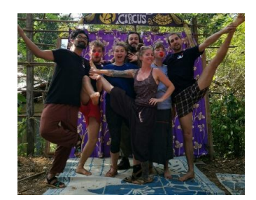
Team India 2020