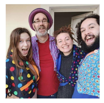
Team Greece 2019