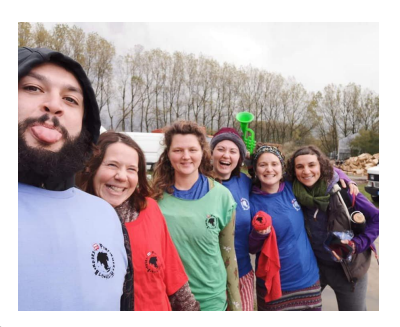
Calais and Dunkirk 2019