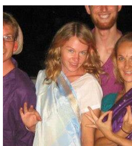
Abi India 2013