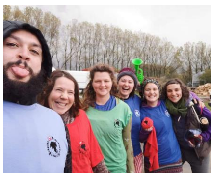
Calais and Dunkirk 2019