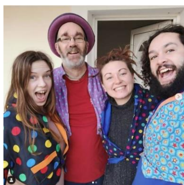
Team Greece 2019