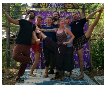
Team India 2020