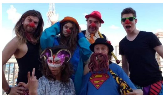
Team Kenya 2020