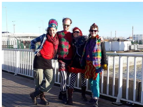
Calais and Dunkirk 2018/2019