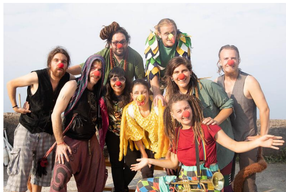
Team India 2019