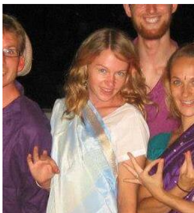
Abi India 2013