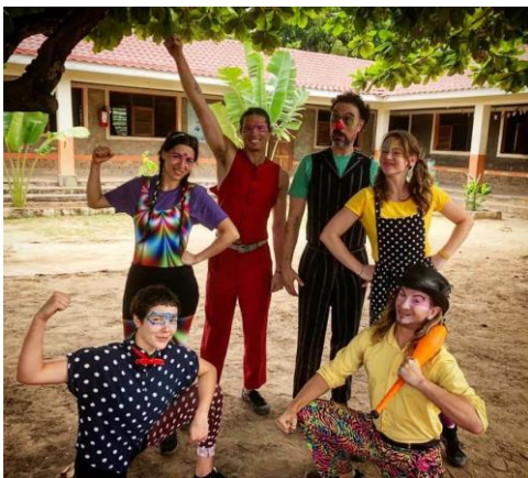
Team Kenya 2019