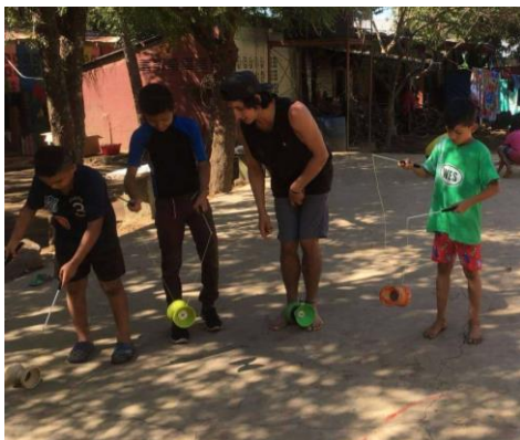
Nicaragua Tour 2019